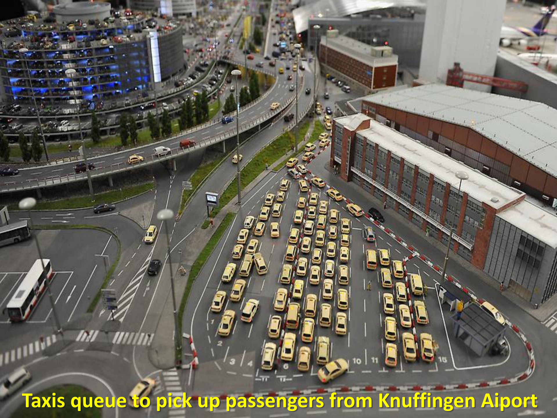
Taxis queue to pick up passengers from Knuffingen Airport