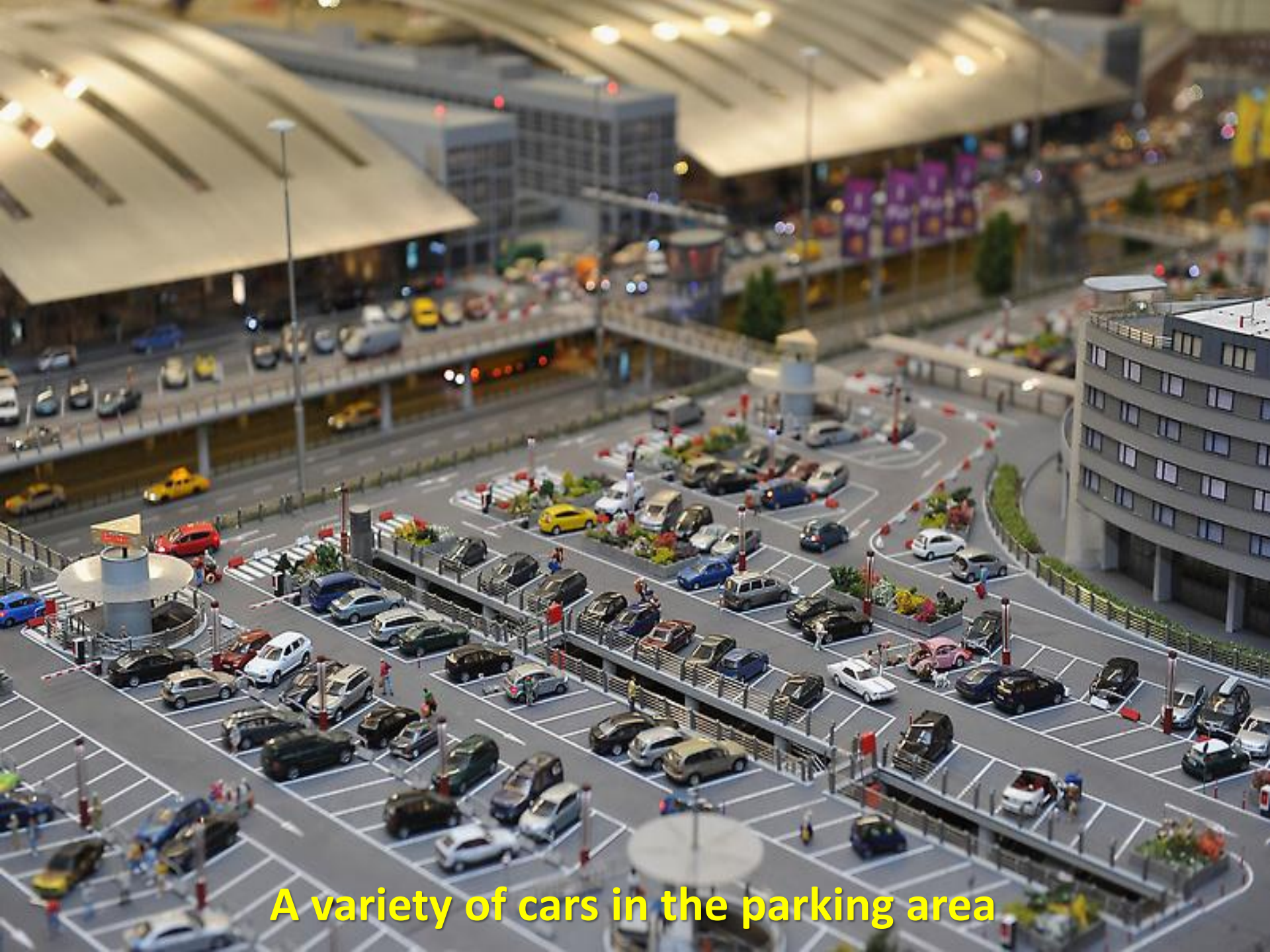
A variety of cars in the parking area