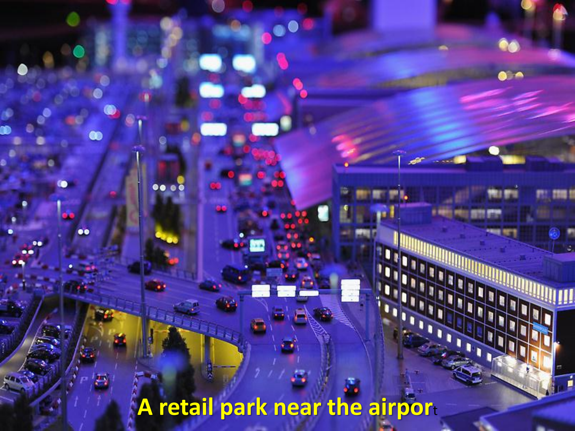
A retail park near the airport