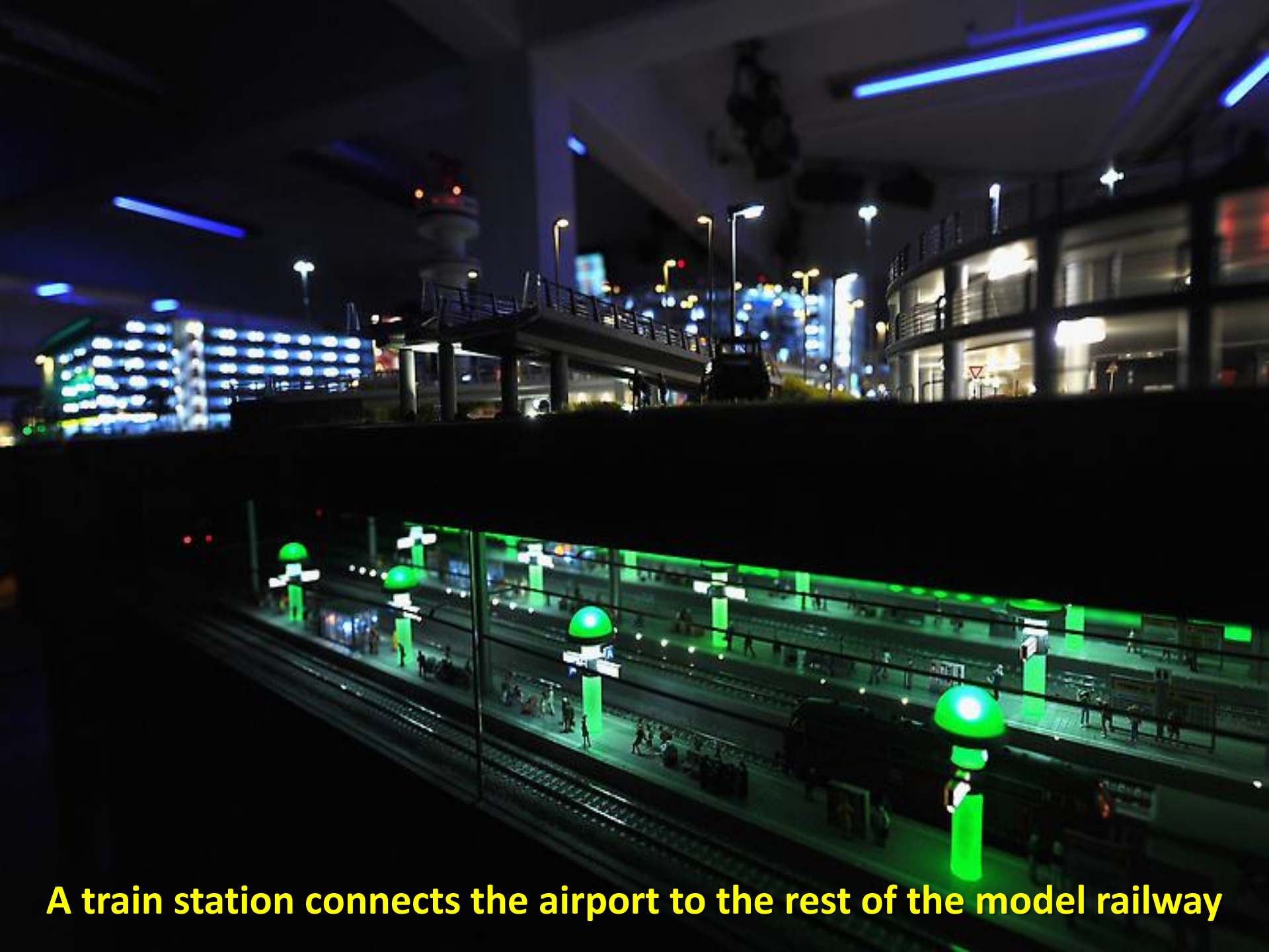
A train station connects the airport to the rest of the model railway