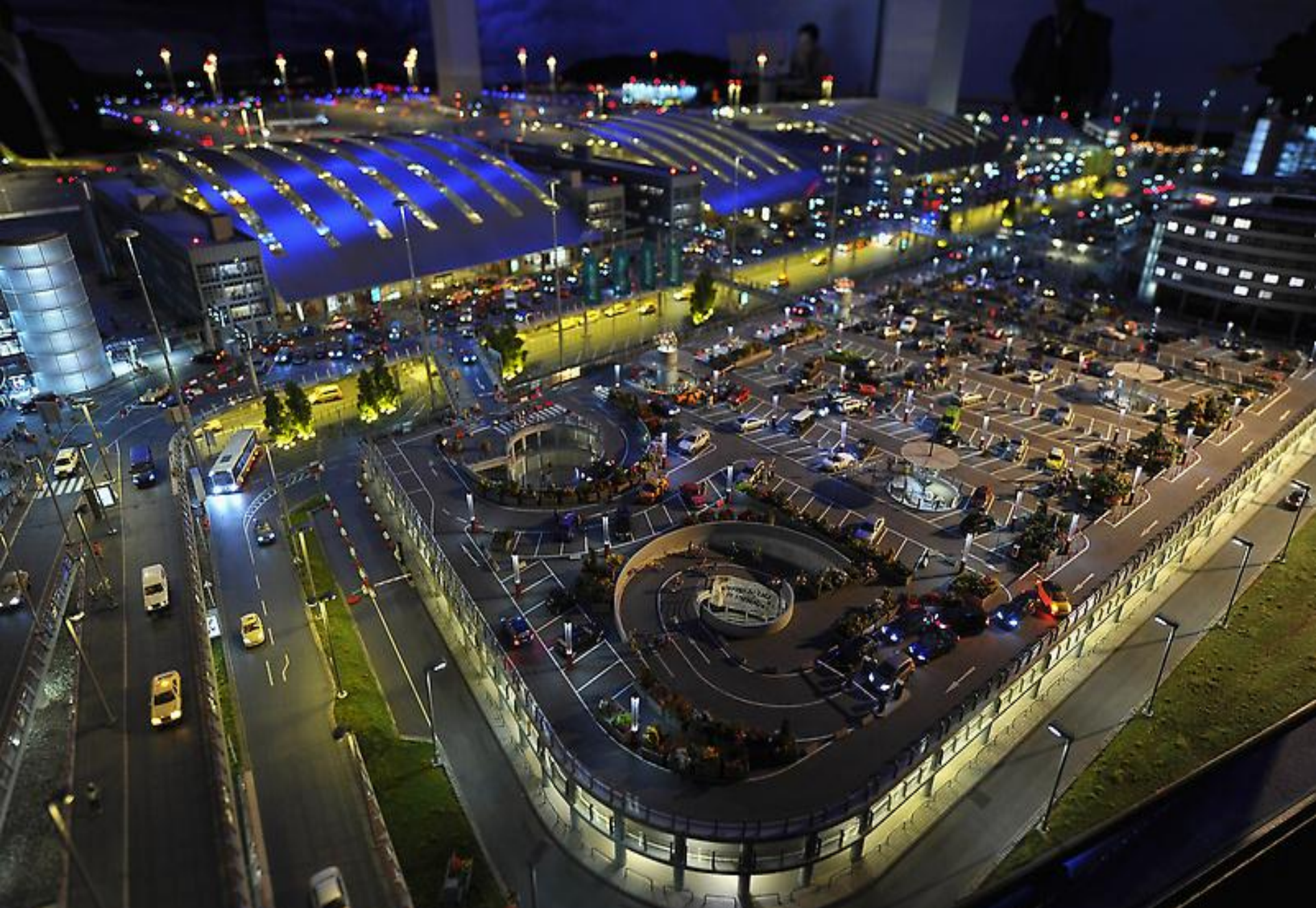
Knuffingen Aiport terminal buildings and car park